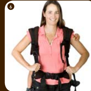
6. Tighten the shoulder straps by pulling down on the adjustment straps if needed.