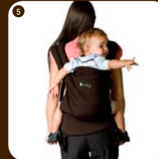
5. Adjust the strap and then stand up.