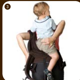
3. At the same time, bend forward to shift baby's weight to your back.