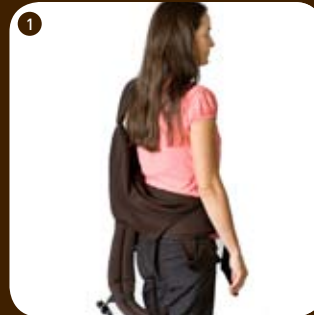
1. Place carrier on your back with shoulder straps on shoulders. Fasten waist belt in the front. Slide right strap off shoulder.