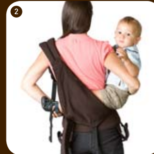
2. Holding baby securely on right hip, slide left hand between carrier and your body. Take a hold of baby's left foot and pull it through the carrier.