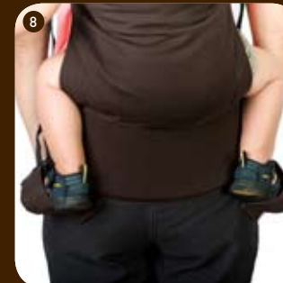
8. To use the foot straps 1 for extra leg support adjust Velcro so that baby's thigh and calf form at least a ninety degree angle.