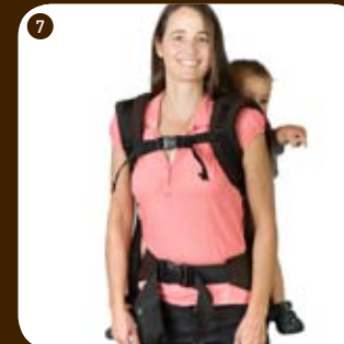
7. Fasten chest strap and secure. Chest strap should be at armpit level. You're all set. Enjoy your Boba!