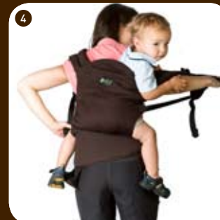
4. Still bending forward, support baby with left hand moving right hand through shoulder strap.